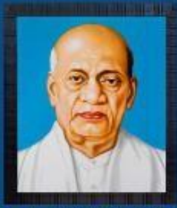
Sardar Vallabh Bhai Patel Iron Man of India

Manpower without unity is not a strength unless it is harmonised and united properly, then it becomes a spiritual power.