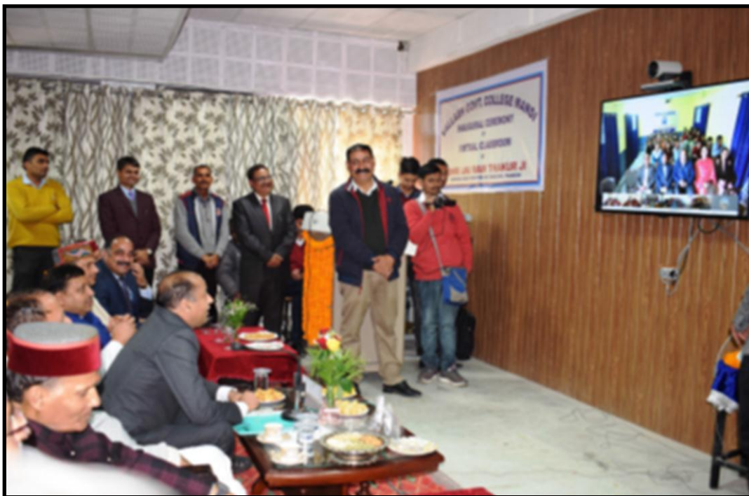
Inauguration of virtual classroom by the Hon'ble Chief Minister Sh. Jai Ram Thakur Ji

Parents/guardians may please note that no separate communication regarding the meeting will be sent. It is the duty of the students to remind their parents/guardians and motivate them to attend the same.