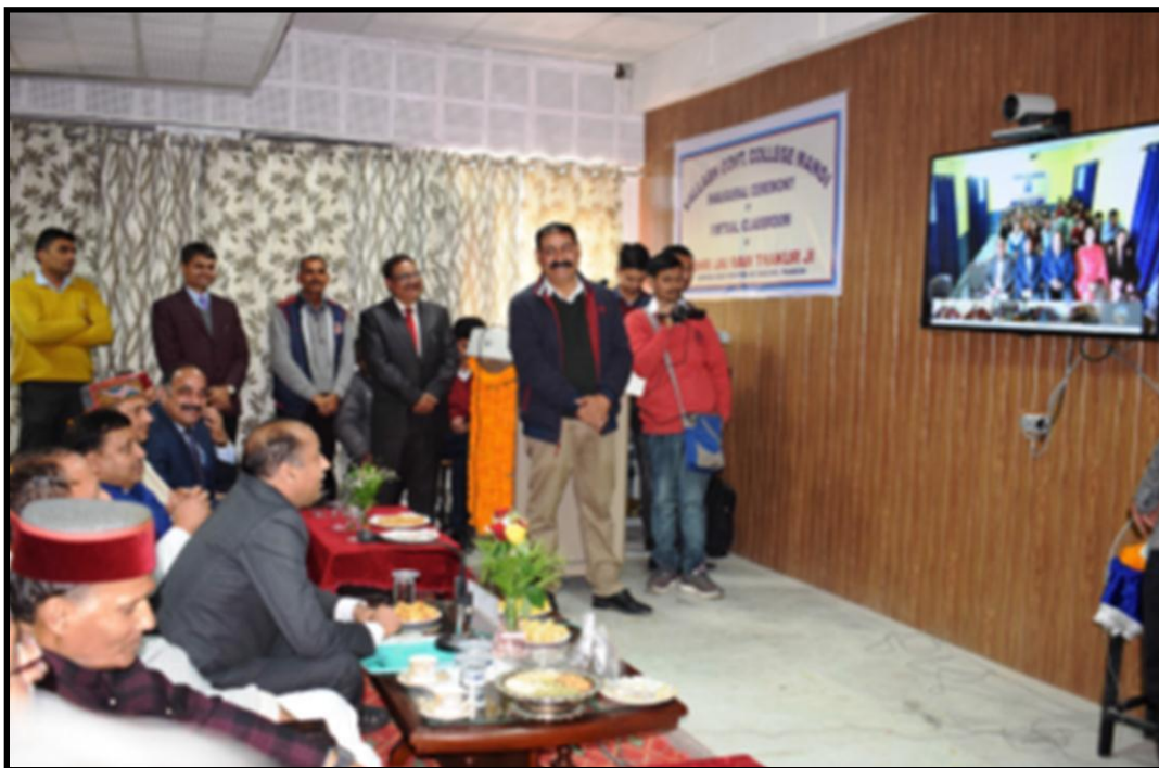
Inauguration of virtual classroom by the Hon'ble Chief Minister Sh. Jai Ram Thakur Ji

Parents/guardians may please note that no separate communication regarding the meeting will be sent. It is the duty of the students to remind their parents/guardians and motivate them to attend the same.