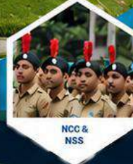
NCC & NSS

MULTIDISCIPLINARY EDUCATION FOR A BETTER TOMORROW