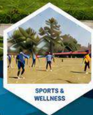
SPORTS & WELLNESS