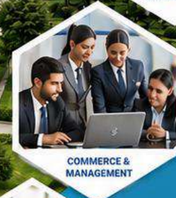
COMMERCE & MANAGEMENT