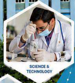
SCIENCE & TECHNOLOGY

A LEGACY OF LEARNING LEADERSHIP & SERVICE