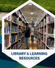
LIBRARY & LEARNING RESOURCES