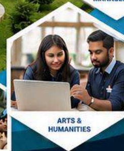
ARTS & HUMANITIES